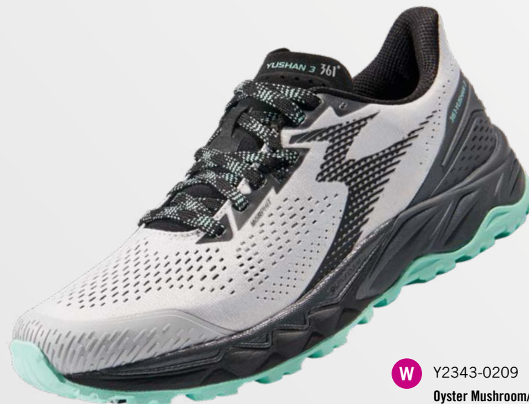
W Y2343-0209 Oyster Mushroom/Black