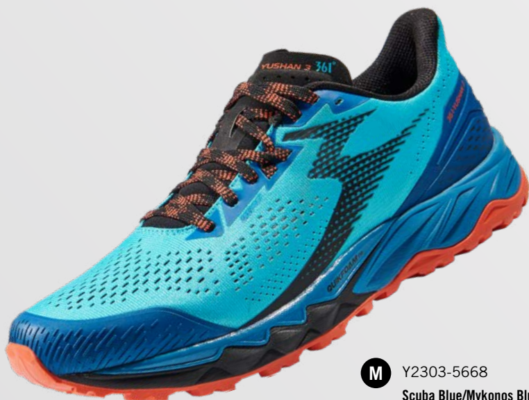
M Y2303-5668 Scuba Blue/Mykonos Blue