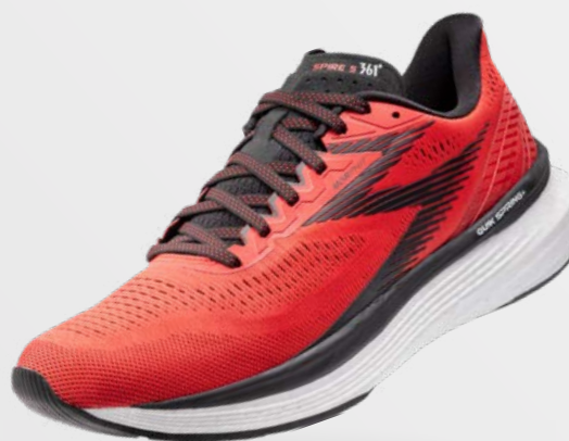
M Y2232-2709 Artisanal Red/Black