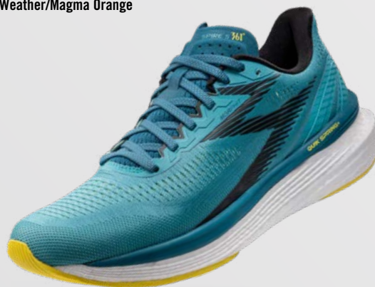
W Y2272-5719 Turquoise Tonic/Celandine