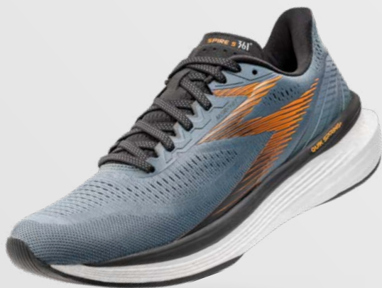
M Y2232-0725 Stormy Weather/Magma Orange