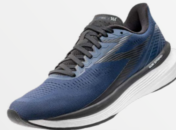
M Y2232-6509 Y2242-6509 (2E) French Navy/Black