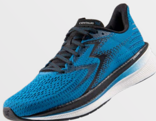
M Y2301-6809 Mykonos Blue/Black