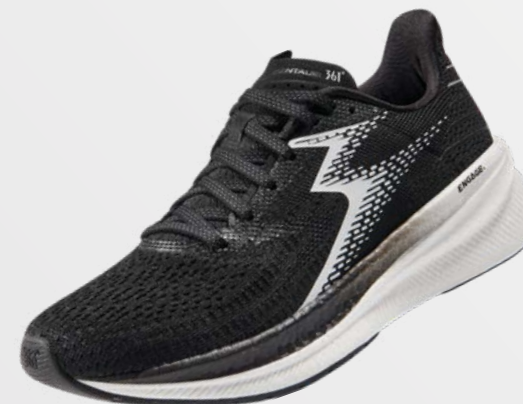
W Y2341-0900 Black/White