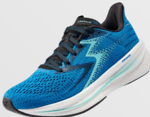
W Y2341-6809 Mykonos Blue/Black