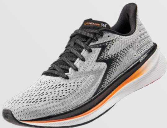
M Y2301-0206 Oyster Mushroom/Sleet