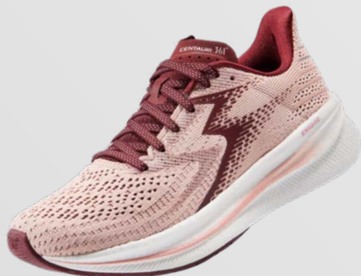
W Y2341-1132 Evening Sand/Dark Cherry