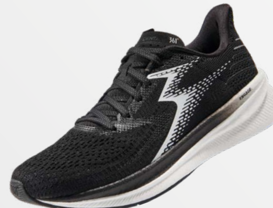
M Y2301-0900 Black/White